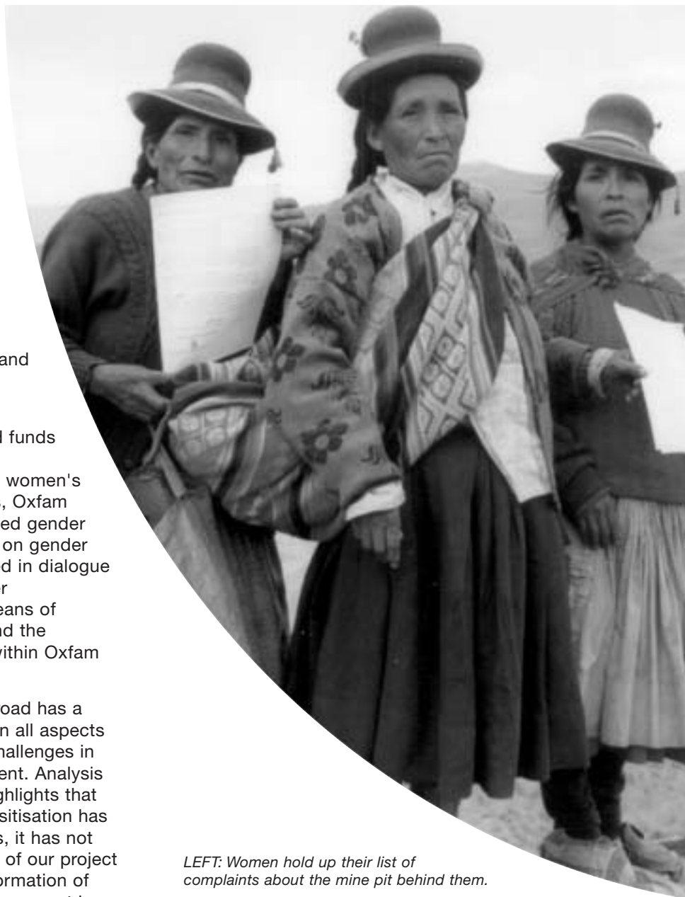
LEFT: Women hold up their list of complaints about the mine pit behind them.

The private sector, including the mining and minerals sector, has an increasingly critical influence over human development. As such, corporations have an increasingly important role in areas affecting gender equality and the rights of women.