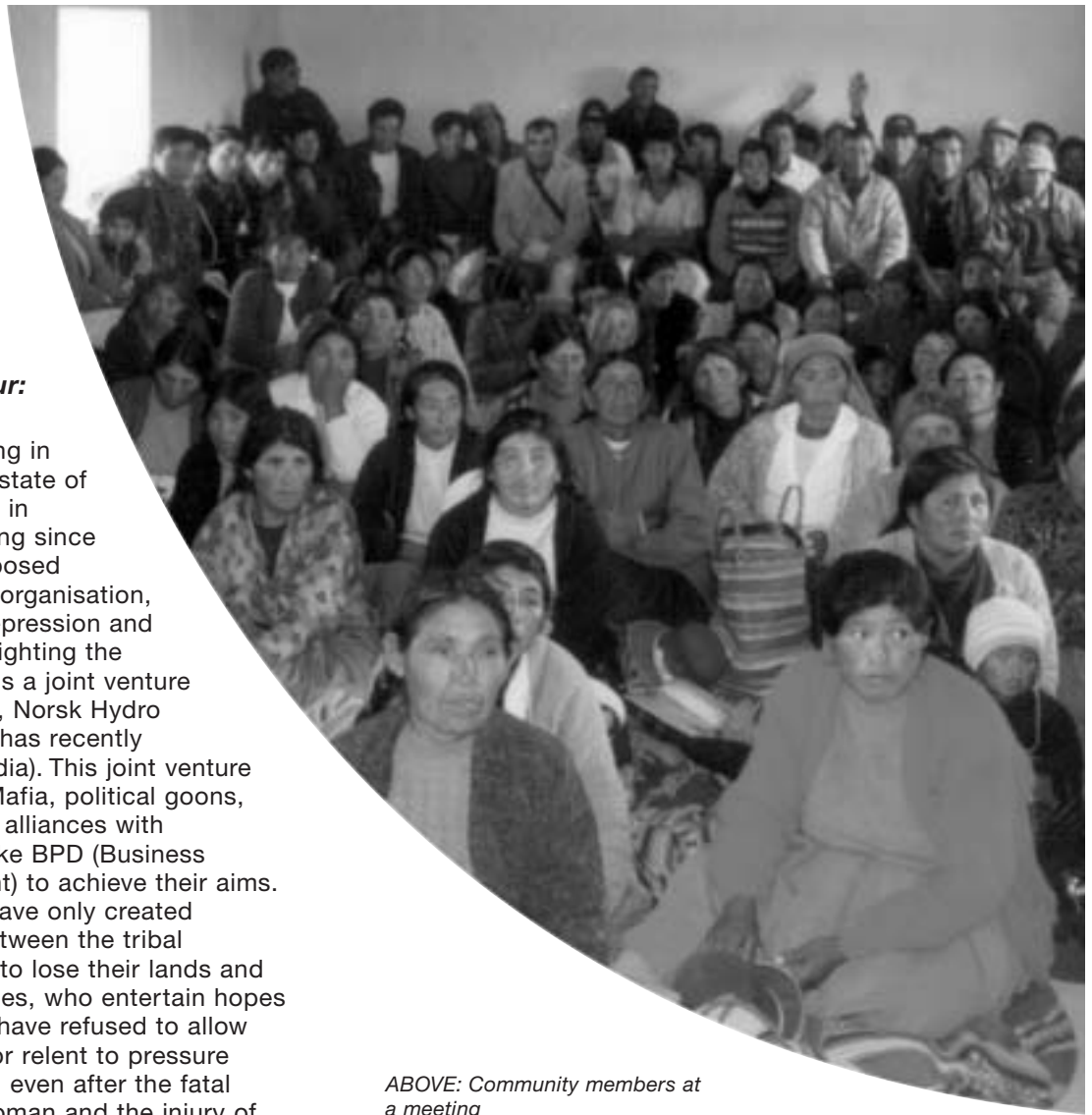
ABOVE: Community members at a meeting present their complaints about a mine operation.

Local struggles against exploitation from mining projects are gaining strength, as the reality of mining based 'development' is becoming increasingly visible. India's government has not taken any serious action towards reducing the educational, vocational, social, economic, and