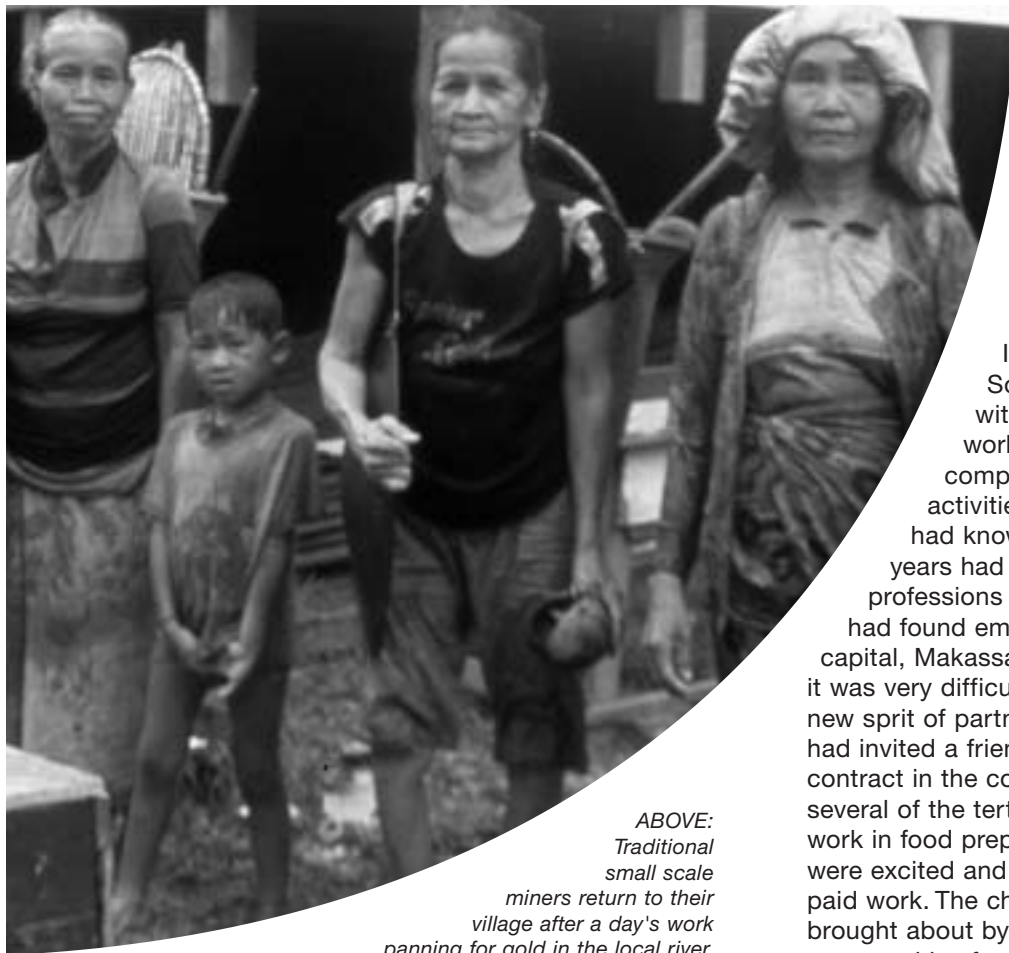
ABOVE: Traditional small scale miners return to their village after a day's work panning for gold in the local river, Central Kalimantan, Indonesia.