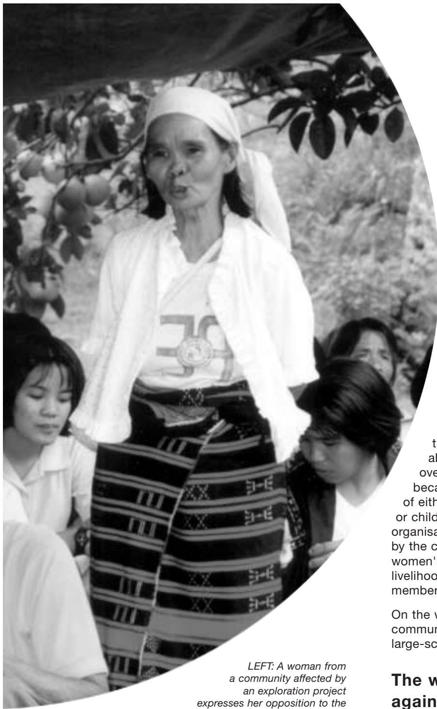
LEFT: A woman from a community affected by an exploration project expresses her opposition to the project in a community meeting in the Philippines.